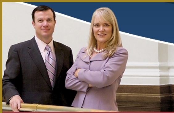
ADVOCACY - GRASSROOTS - COALITION BUILDING

If you usually get a shot at the office but you are now working from home, you'll have to make another plan. If you usually stop into the pharmacy or supermarket while you're running errands, you will have to make an intentional trip to get a shot. This year, make a plan and get it done.